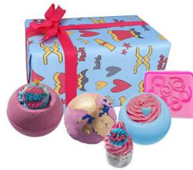
Unwanted gifts/gift sets