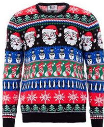
Christmas jumpers or fancy dress costumes