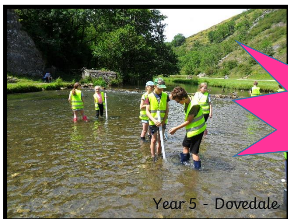
Year 5 - Dovedale

Linking Geography to the wider curriculum