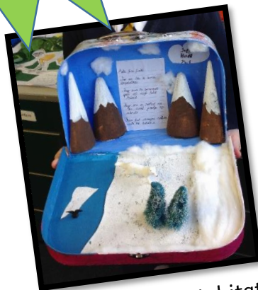
Year 4 - Science Habitats